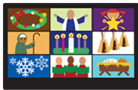
Virtual Christmas Program

December 20 - The annual Christmas Pageant will take place during Sunday worship. Stay tuned for details!