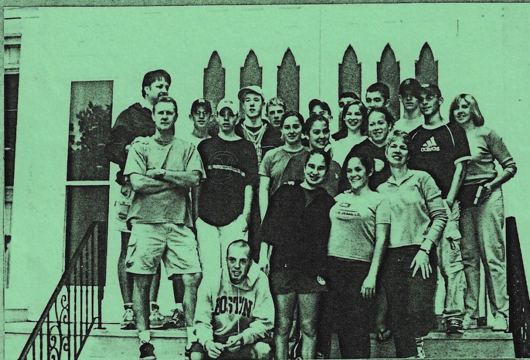
SENIOR HIGH YOUTH MISSION TRIP KENTUCKY, JUNE 2001

FIRST CONGREGATIONAL CHURCH UNITED CHURCH OF CHRIST GEORGETOWN, MASSACHUSETTS